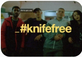
Knife Crime, Robbery & Serious Violence